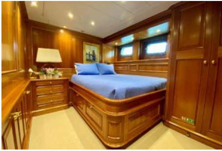
Double Guest Stateroom