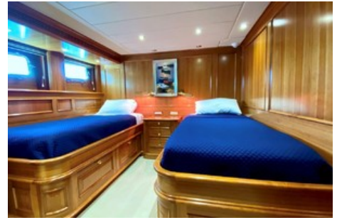
Twin Guest Stateroom